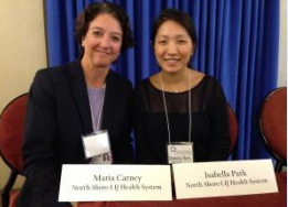
At the Queens Conference for Aging Immigrants.